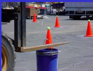
First you must pick up the bucket of water