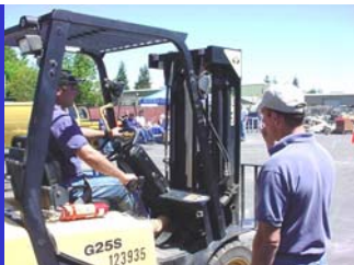
Ready...Set... Go! And the clock is running!

In addition, Whitecap was there with tools offered at great prices and they gave away some terrific tools too! Other gifts were donated by United Rentals and RSC. Pizza and sodas was served for lunch. It was a great day and a lot of fun!