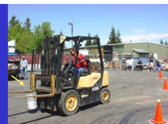
I said carefully