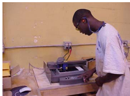
Left: New Phenolic plate machine for creating panel labels and such.