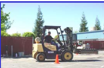
Did I mention you have to drive backwards?