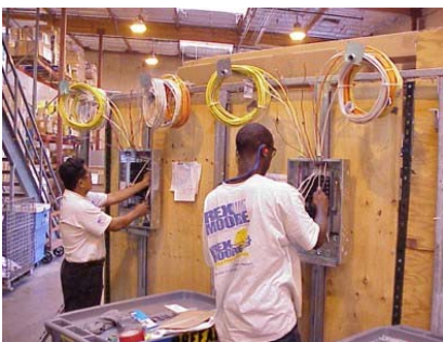
Left: Panels with homeruns for apartment units.