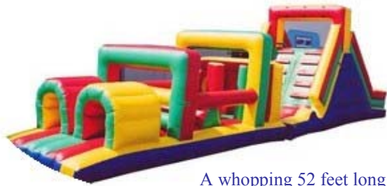
A whopping 52 feet long!

Games include a combination inflatable train bounce house/water slide for the kids (see above), a bungee run for