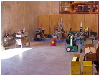
Pipe Bending Area

blies, utility bollards, strut racks, temp power set ups, flex whips, pre-assembled fixtures and any other item that can be dreamed up. In June, a rebar bending machine will be added, giving us the ability to make rebar cages for pole bases. Basically, anything that can be done in repetition in a controlled environment can be prefabbed for a cost savings.