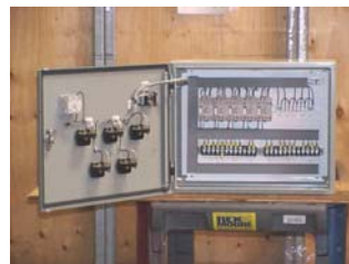
Lighting Controls Box