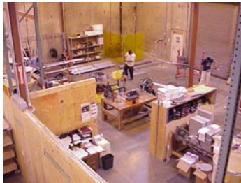
View of inside prefab area

In today's construction environment, Rex Moore is faced with many variables that make it difficult to keep a competitive edge. In order to remain competitive in the market place, while still providing better than average wages,