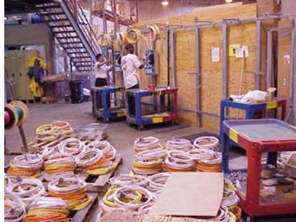
Panel make-up with homeruns cut to length.

If you have any ideas or comments, please contact Kurt Odra at 916-807-4677.