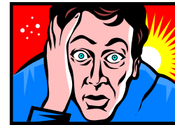
Don't wait till the last minute