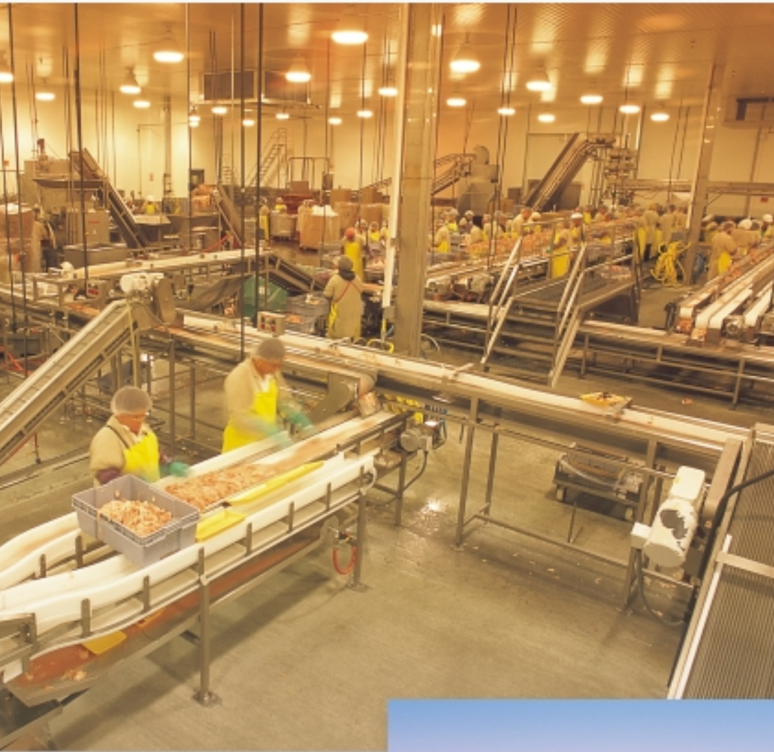
Foster Farms Deboning Facility - Fresno, CA Food Processing and Packaging Facility Electrical Contract Value: + $1 Million Project Specifics: • Cold Storage • Food Prep Facility • Conveyor Controls