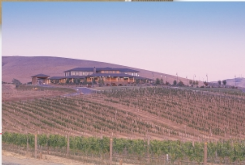
Kirkland Ranch Winery - Napa, CA Project Specifics: • Wine Processing • Tank Storage • Barrel Storage • Tasting Room